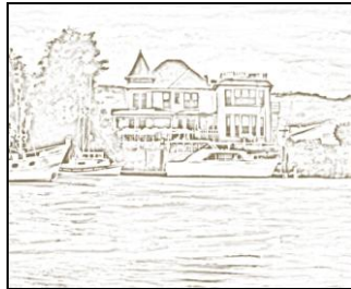
Petaluma River / River House

The committee hopes to have a coloring book with PAA members drawings ready for Art in the Park. At least twelve line drawings of local subjects are needed. The finished drawings are to be 8 by 10 inches. Ink or pencil accepted. A brief description of each artist and site will be included. Suggested drawing sites are the Old Adobe, The Silk Mill, the Gazebo at Walnut Park, boats at the turning basin, birds at Shollenberger Park, chickens, farm buildings. To avoid duplication, it is recommended that interested artists call Pat Marshall (763-2308) to say what they are drawing. Call Pat Marshall (763-2308) with questions.